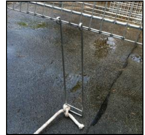
4. Prop bar in raised position

(e) Raise prop bar. Lift the side of the trap with the prop bar and position the raised trap so it rests securely on the prop bar. You should tie a string or cord to the prop to pull after cats have entered the trap.