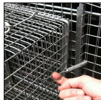
7. Attach clips to box trap