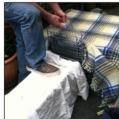
8. Open both doors.