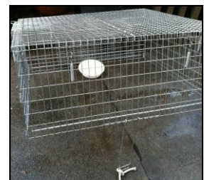
5. Bowl in center-back.

(b) Position the bowl. Place the filled bowl in the center of the back of the trap (the back of the trap is the side to which the weight flap is attached). This way the cat will have to go as far into the trap as possible before settling in to eat ( photo 5 ).