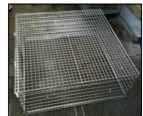
2. Top over main frame

(b) Attach the top. Unfold the top then place it over the main frame of the drop trap ( photo 2 ). Attach all the spring clips, except the two immediately next to the sliding door frame, to the top ( photo 3 ). Make sure all the hooks are fastened so no gaps can open if a cat pushes against the top.