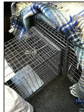
6. Line up doors

(a) Uncover the top of the drop trap. If the cat doesn't move towards the doors, try slowly pulling the cover over the drop trap towards you. Feral cats will tend to move from bright, open areas to dark, covered ones so exposing the top of the drop trap will