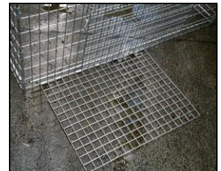
1. Weight flap unfolded.

(a) First steps. Unfold the main frame of the trap so that it forms a square. Unfold the weight flap ( photo 1 ), then remove the sliding door and temporarily put it aside.